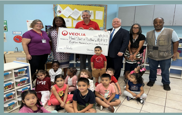
Veolia Water of New York donated IPADS to Head Start of Rockland for their students.