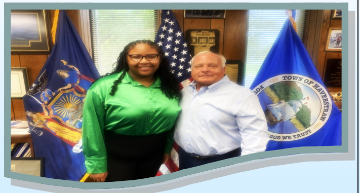
Each year, the Town of Haverstraw partners with the NRHS Academy of Finance Internship Program.