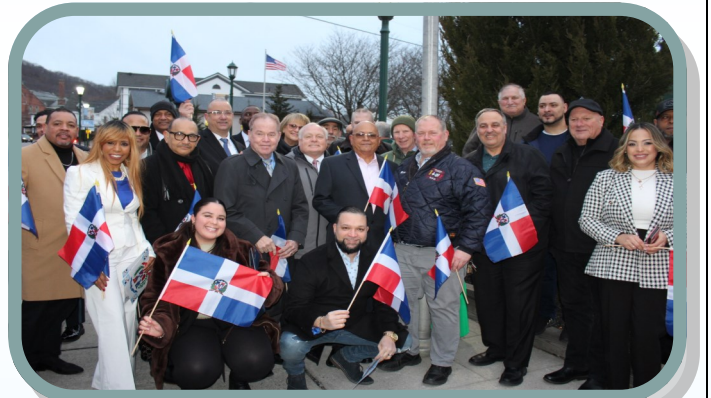
Dominican Independence Day Flag raising in the Village of Haverstraw.