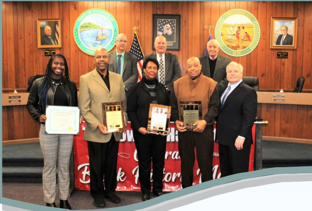
Honorees for Black History Month were recognized at the February Town of Haverstraw Board meeting.